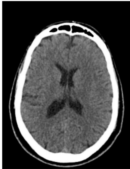
Figure 03: Control cranial CT scan – 3 months post-surgery (Axial view – without contrast).

The patient remained hospitalized for 5 days for monitoring and was discharged with complete improvement of the deficits. In an outpatient follow-up visit 15 days after hospital discharge, she remained without deficits and showed significant improvement in the headache. A postoperative control CT scan (Figure 03) was performed 3 months after surgery, showing no residual signs of intracranial bleeding.